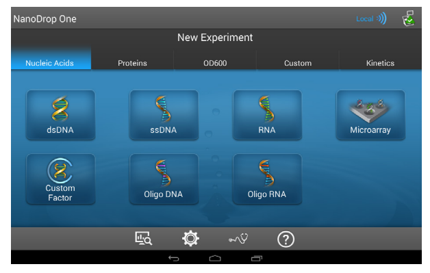
Figure 1: NanoDrop One software, nucleic acids Home screen

Life scientists can quantify nucleic acid samples on the Thermo Scientific<sup>™</sup> NanoDrop<sup>™</sup> One and One<sup>C</sup> microvolume UV-Vis spectrophotometers using the preprogrammed applications for dsDNA, ssDNA, RNA, oligo DNA and oligo RNA (Figure 1). This technical note illustrates NanoDrop One spectrophotometer performance across the instrument's dynamic range using dsDNA.