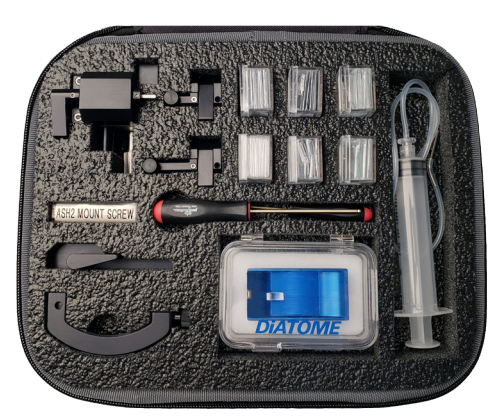
73328 - ACCESSORY KIT (OPTIONAL ACCESSORIES SHOWN)