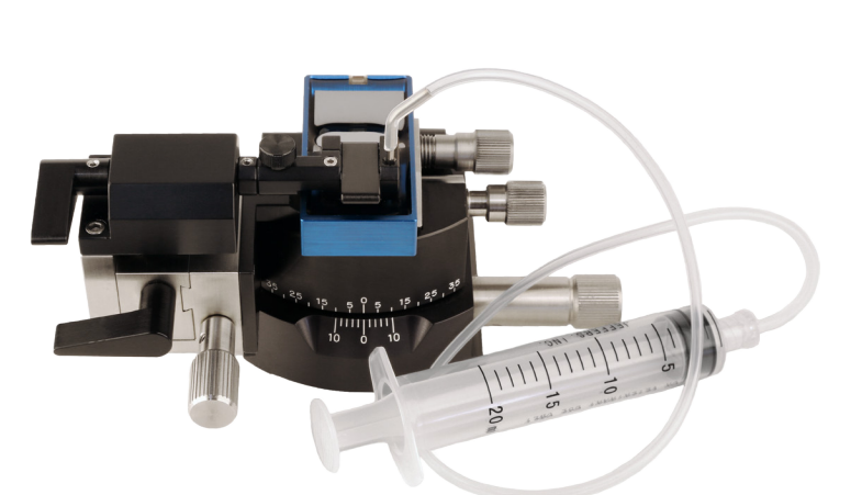
73327 - WATER FILL SYSTEM

50860 Diatome UltraJumbo Diamond Knife (for 25mm x 25mm substrates) 50861 Diatome UltraMaxi Diamond Knife (for 10mm x 25mm substrates) 50851 Diatome Ultra Diamond Knife (for 10mm x 25mm substrates)