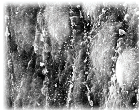
SEM of the internal surface of the carotid (human) artery. This samdried (critical point dried) sample shows not only surface membrane details but also endothelial cell boundaries and their nuclei.